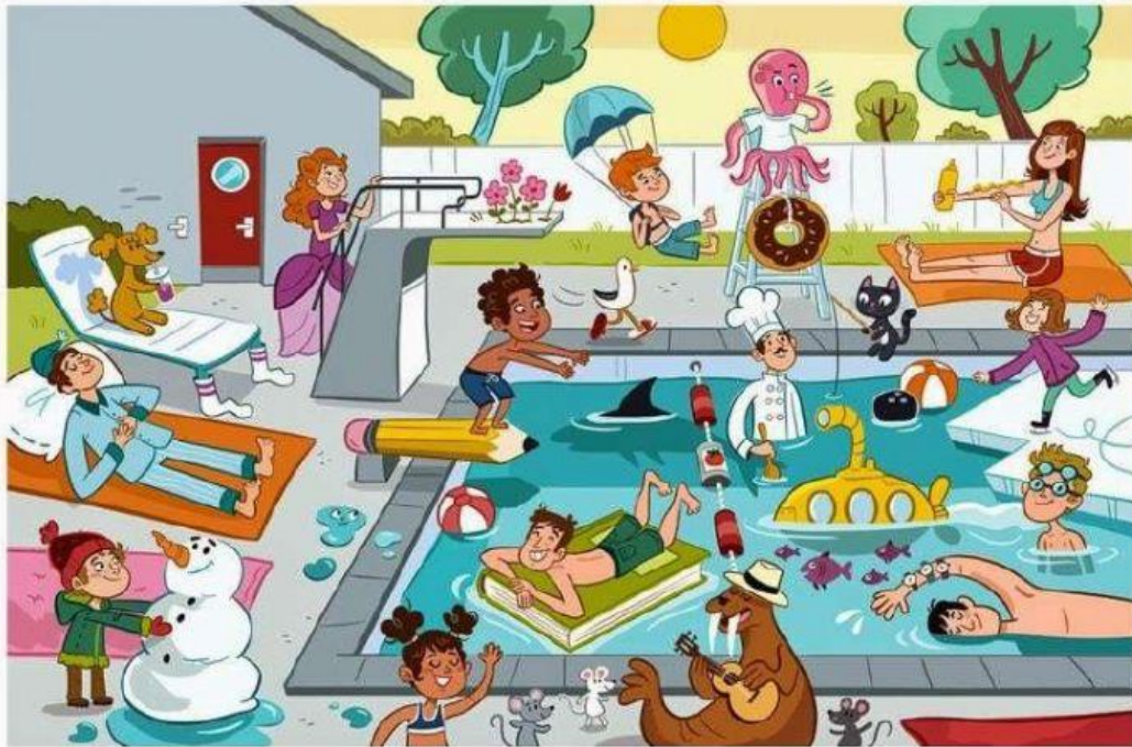
Silly Swim Client: Highlight Puzzlemania

A BOOK IN THE WATER SEVEN ANIMALS THREE BALLS IN THE WATER A SHARK A DOG TWELVE PEOPLE