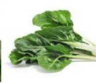
LETTUCE CAULIFLOWER CORN PEPPER CUCUMBER CHARD