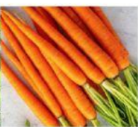
ONION GARLIC SPINACH POTATOE BROCCOLI CARROT