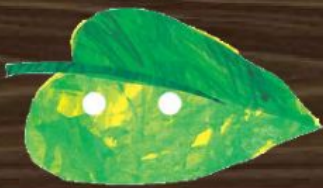
EGGS ON A LEAF