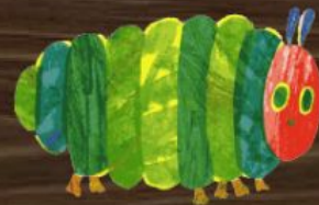
A BIG, FAT CATERPILLAR