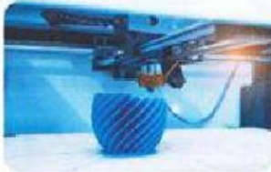
1 3D printer

action camera drone smart bracelet smart watch wireless charger wireless headset wireless speaker 3D-printer