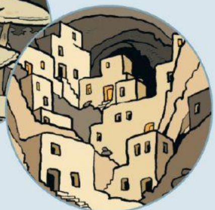
d a town