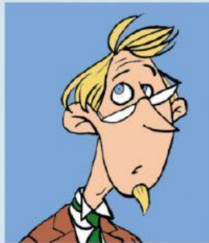
a Professor Otto Lidenbrock