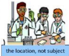
the location, not subject