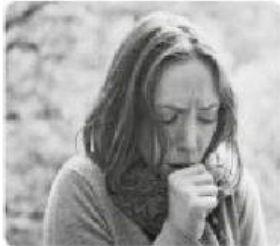
4. She has a cough / sore neck .