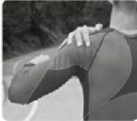
1. He has a sore shoulder / stomachache .