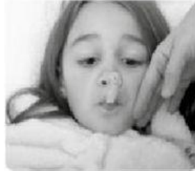
2. She has a cough / is sick .