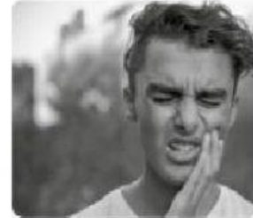
3. He has a cold / toothache .