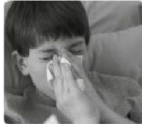
5. He has a cold / sore shoulder .