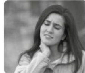
6. She has a sore neck / backache .