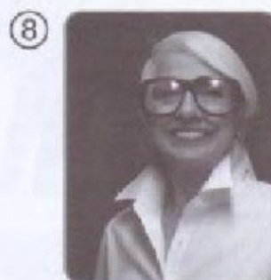
She's got glasses / a beard.