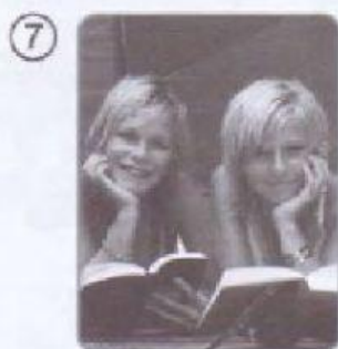
They've got short fair / dark hair.