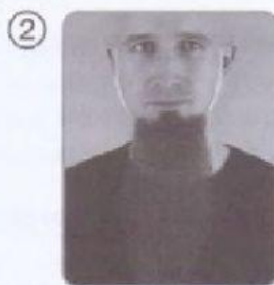
He's got a big beard / moustache.