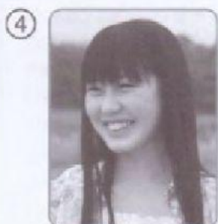
She's got a short / long black hair.