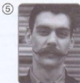
He's got a beard / moustache.