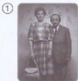
He's short / tall.