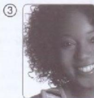
Her hair is curly / straight.