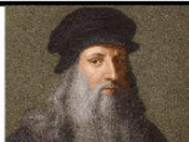
LEONARDO DA VINCI