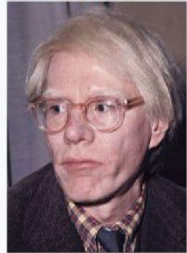
Warhol in 1975