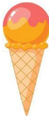
ICE - CREAM