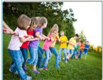
at summer camp