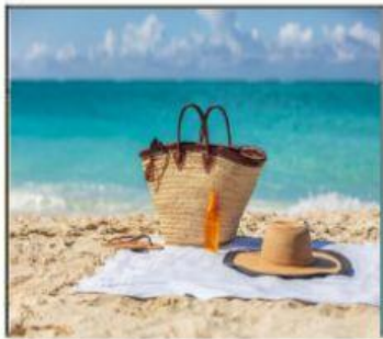
at the seaside [ˈsiːsaɪd]