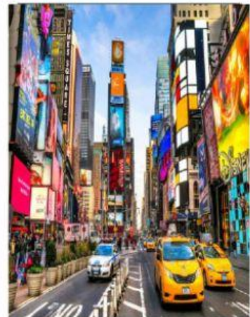
in town [taʊn]