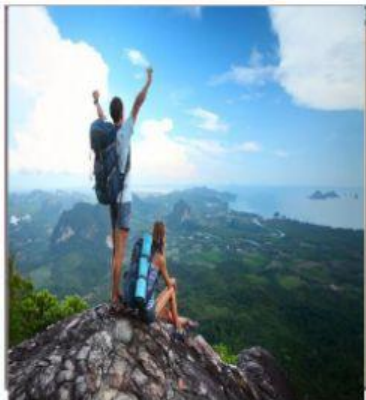
in the mountains [ˈmaʊntɪnz]