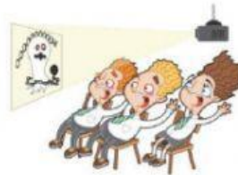
3. Ghost Ship is ..... movie in the world!