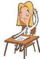
2. This is ..... exercise in the test.