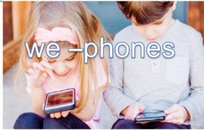
we - phones