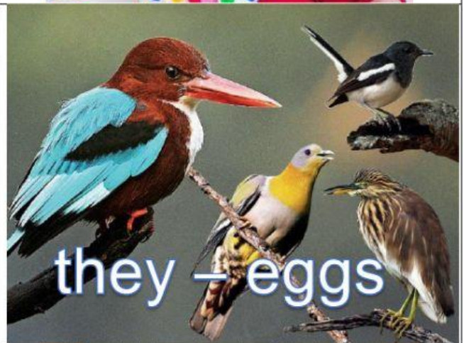
they - eggs