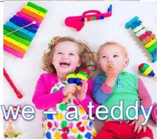
we - a teddy