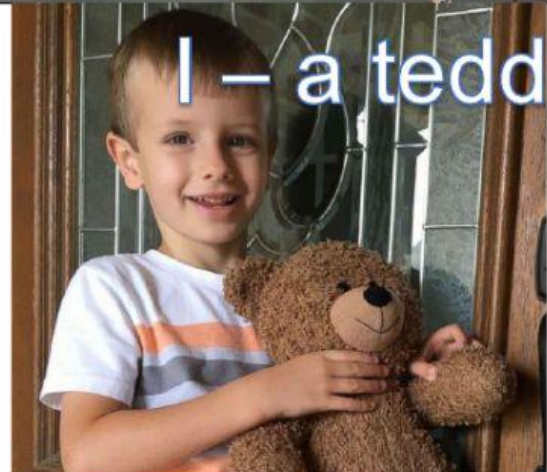
I - a teddy