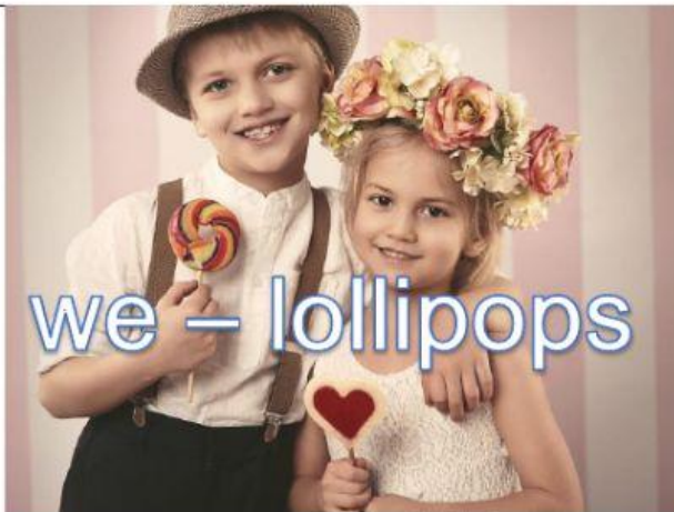
we - lollipops