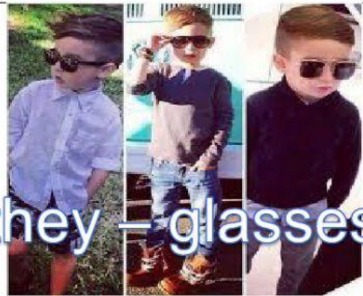
they - glasses