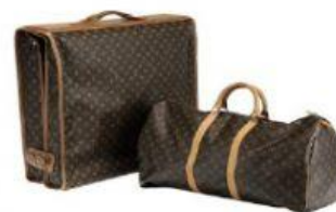
two pieces of luggage