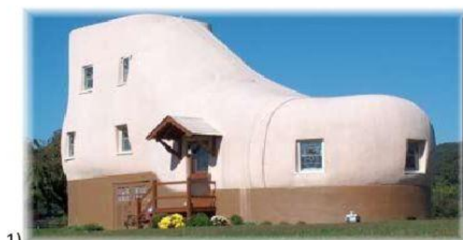
The Shouse House.