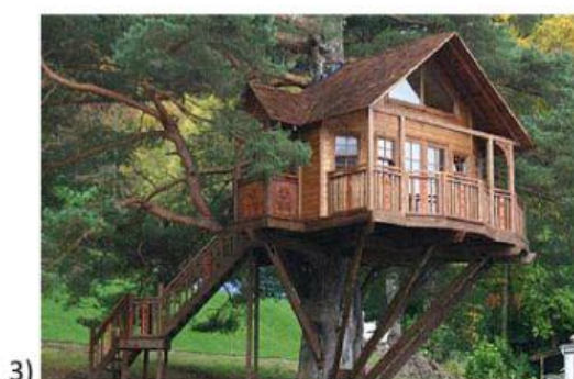
The Tree House . Built : 2004