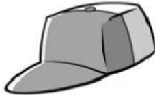
It's a _____ .