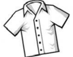
It's a _____ .