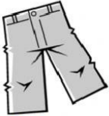
They're _____ .