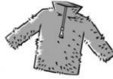
It's a _____ .