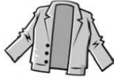
It's a _____ .