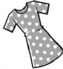
It's a _____ .