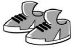
They're _____ .