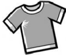
It's a _____ .