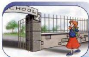
go to school