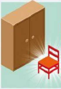
in front of