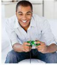
3 _____ online games