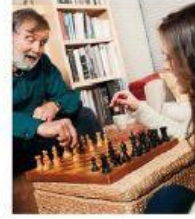
10 _____ chess