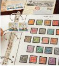
13 _____ stamps