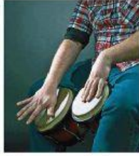
7 _____ the drums