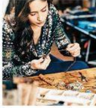
8 _____ jewelry