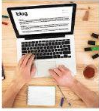
6 _____ a blog