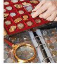
15 _____ coins