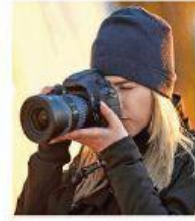
5 _____ photos