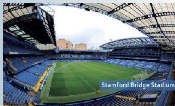
Stamford Bridge Stadium

The girls were a little surprised, and they asked the taxi driver where they were. "In Stamford Bridge," he said. "Where did you want to go?"