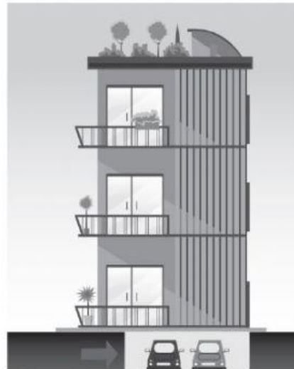
2. b a _ _ _ _ n t