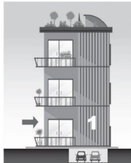
6. f _ _ r