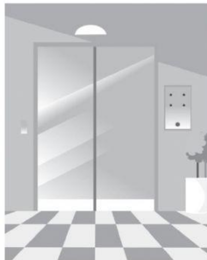
4. l _ _ t