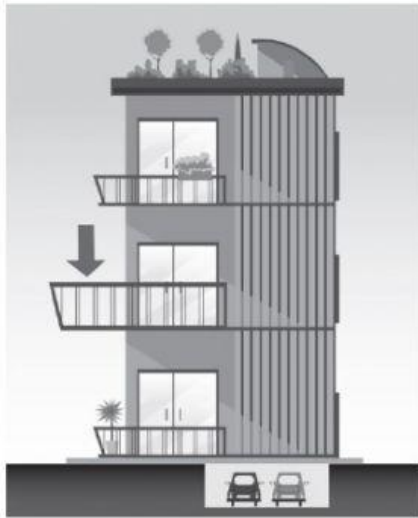
1. b al c ony