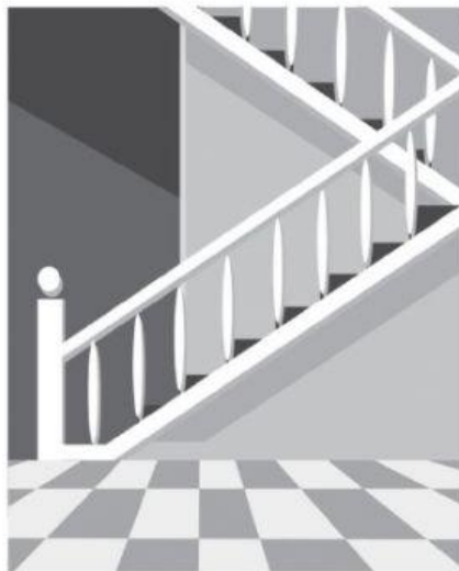
3. s _ _ _ _ r s