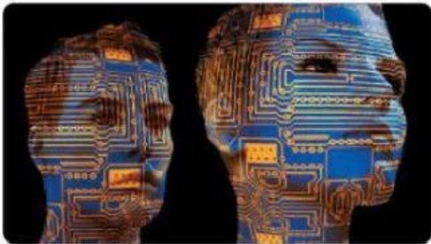
c. Human enhancement/augmentation