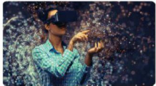
d. Immersive virtual reality