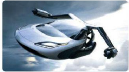
b. Flying cars