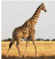
A giraffe is