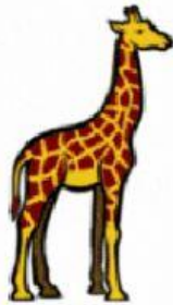
A giraffe is