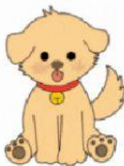
A dog is