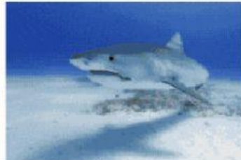
A shark is