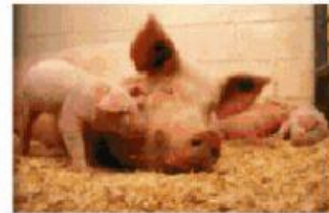
A pig is