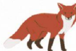
A fox is