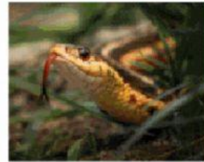
A snake is