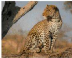
A leopard is