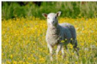
A sheep is