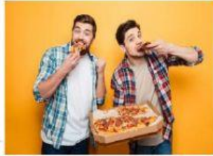
B. had pizza