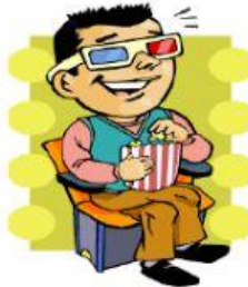
B. watched a film