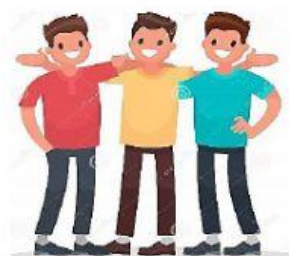
A. met friends