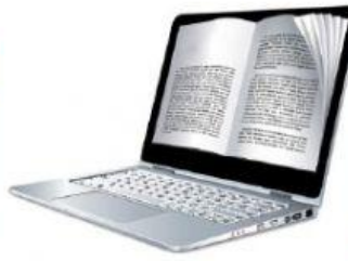
B. read on the computer