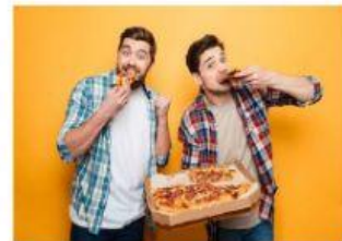
C. had pizza