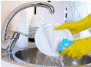
A. washed dishes

8.- Tom and his father ..... on Sunday morning.