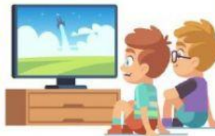
B. watched TV