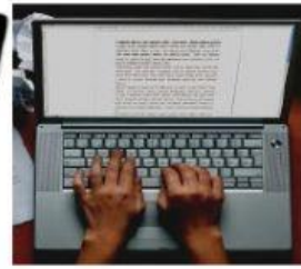
C. wrote on the computer