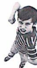
For my mother

The fight against cancer is never a one-woman battle. Let's stand united for CODENAMED PINK in protecting and empowering women. Our experts will provide inspiring insights at JT Hospital.