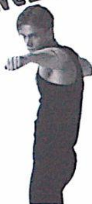
For my wife