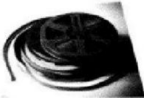
0 lfmi film

1 Put the letters in the right order to make school clubs.