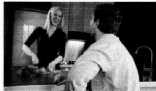
4 Her mum is _____ (make) lunch and her dad is _____ (sit) on a chair.

2 Complete the sentences with the words from the box. Use the correct form.