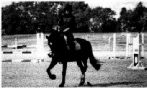
1 Julia's _____ (ride) a horse.

1 Look at the pictures. Put the verbs in brackets in the correct form.