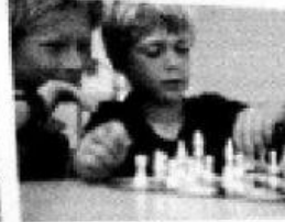
8 daobr msega