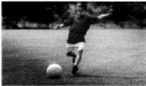
2 Her brother is _____ (kick) a ball.