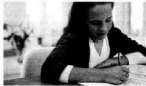
3 Her sister isn't _____ (write) a letter. She's _____ (do) her homework.