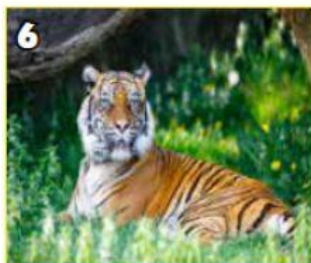
6 tiger / octopus