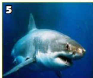
5 seal / shark