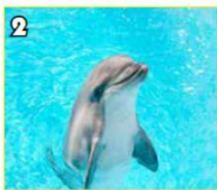
2 kangaroo / dolphin