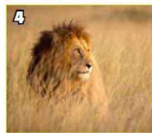
4 lion / penguin