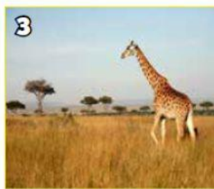
3 squirrel / giraffe