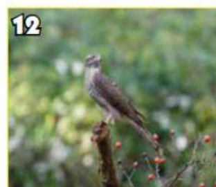
12 hawk / bear