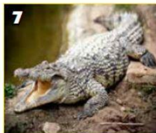
7 monkey / crocodile