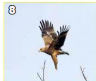
8 eagle / elephant