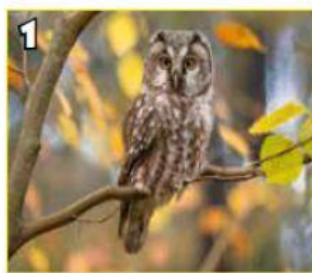
1 owl / ostrich