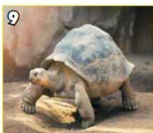
9 bear / tortoise