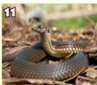
11 lizard / snake