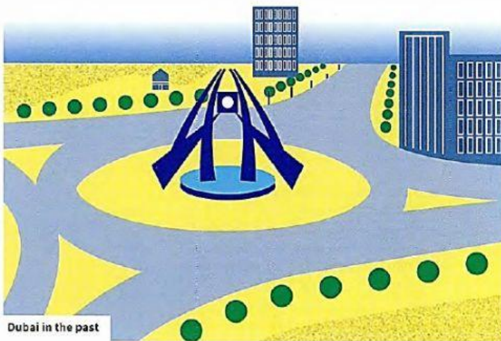
Dubai in the past