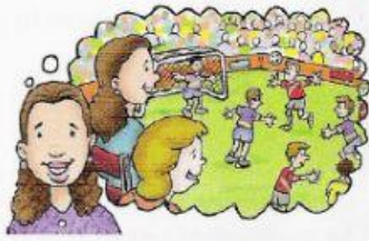
go to a soccer game

Practice conversations with other students. Practice inviting, apologizing, and giving reasons.