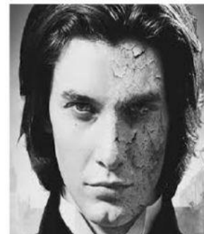
THE PICTURE OF DORIAN GRAY OSCAR WILDE