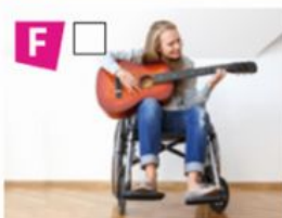
..... the guitar