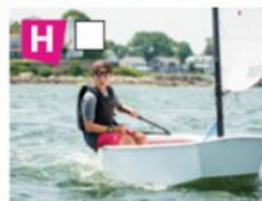
..... a boat