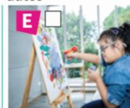
..... a picture