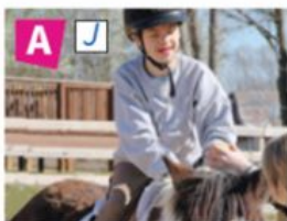
..... a horse

cook paint play remember ride sail sing skate speak swim