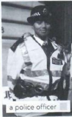
a police officer