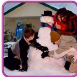
build a snowman