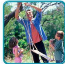
make a swing