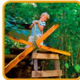
build a tree house