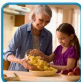
make apple pie