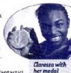
Claressa with her medal

I 4 _____ two Olympic gold medals, one from London and one from Rio. I 5 _____ the first American boxer to win two Olympic golds. I 6 _____ to win more gold medals. I 7 _____ boxing, it's fantastic!