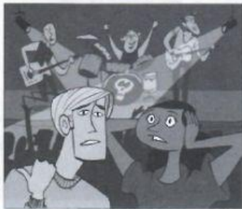
1 Let's go home.

Let's go home. Let's go there. Let's not eat here. Let's open the window. Let's sit here. Let's stop here.