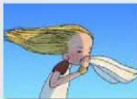
4 flu / rash