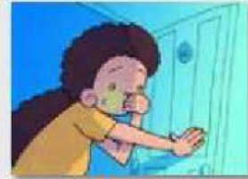
2 sore throat / sick