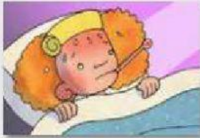
fever / rash