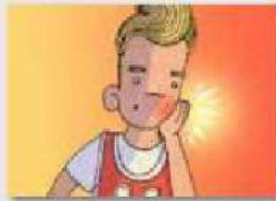
1 toothache / flu