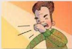
3 cough / dizzy