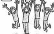
w _ _