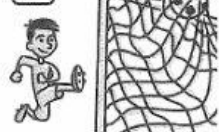
sc _ r _