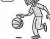
boun _ _