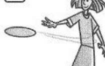
t _ r _ w