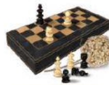
snake and ladder