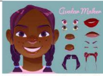
An online representation of myself