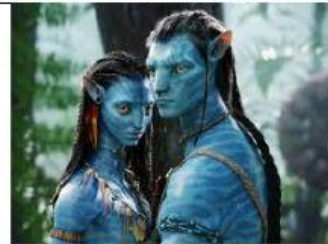
A blue creature in a Disney movie