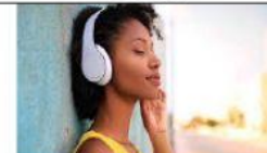
Listen to music