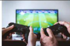
Play video games