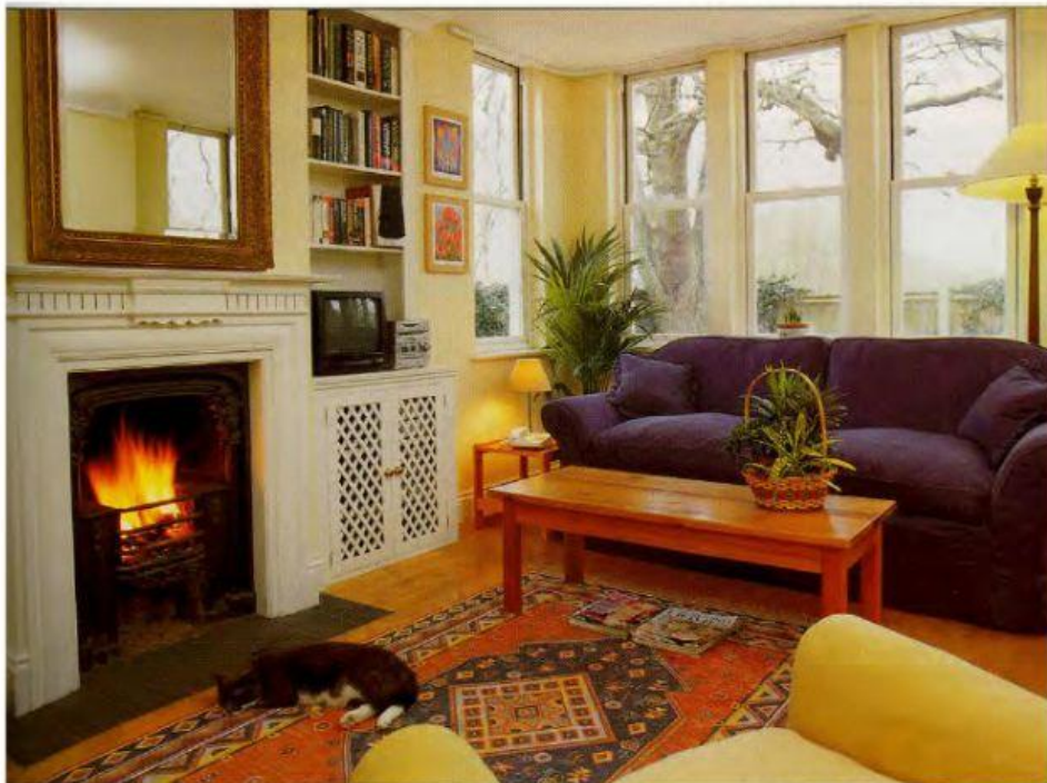
Helen's living room