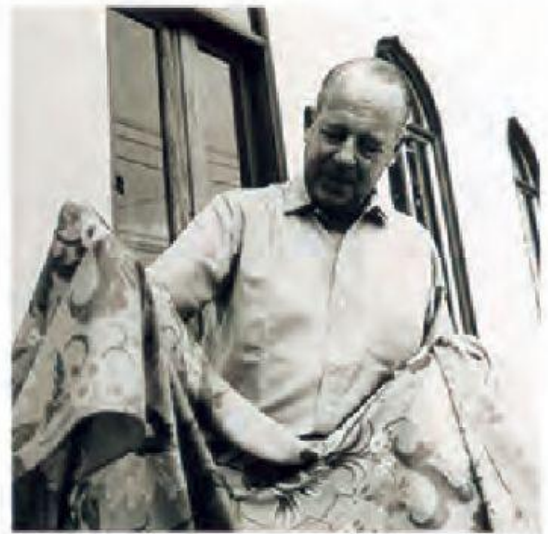
The last photo taken of Jim Thompson before he disappeared in Malaysia in 1967

1. ( maintained / headed ) out alone for an afternoon walk in Malaysia's Cameron Highlands, and was never seen again. A huge search 2. ( approach / effort ) involved more than 400 people spreading out into the jungle, but nothing was found. After a(n) 3. ( investigation / flight ), the conclusion was that he fell into an animal trap or was eaten by a tiger. However, other ideas have been put forward to explain Thompson's 4. ( disappearance / response ). Some believe he was murdered, while others think he faked his own death. His disappearance may always remain a mystery. However, Jim Thompson's presence can still be felt. Shoppers crowd his stores in Thailand to buy 5. ( shine / bright ) scarves and elegant ties. His former home in Bangkok remains one of the capital's top tourist attractions.