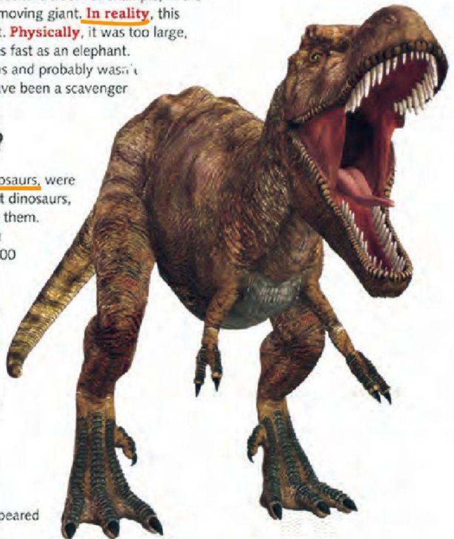
▲ Tyrannosaurus rex ( T. rex )