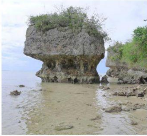
Limestone shoreline weathering in Guam