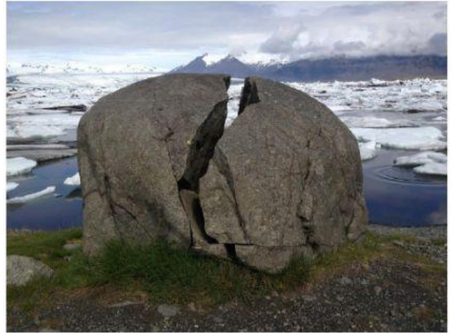
Physical weathering in Iceland