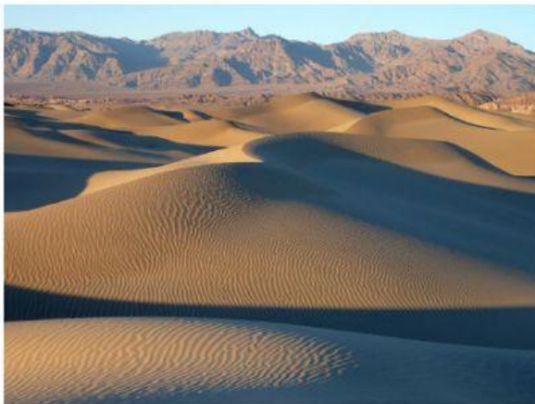
Sand blown by wind deposits in the form of sand dunes in Death Valley