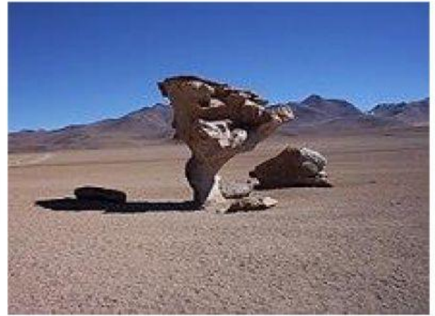
A rock formation sculpted by wind erosion in Bolivia