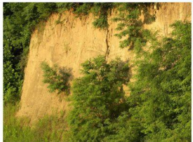
The wind deposits sediment that create a yellowish wall like structure called Loess in Mississippi US.