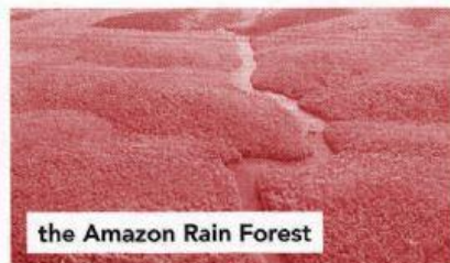
the Amazon Rain Forest