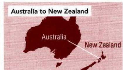
Australia to New Zealand