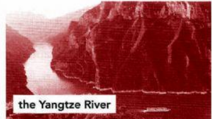
the Yangtze River