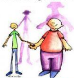
MAN ON THE LEFT - THIN

The green ball is bigger than the other balls.