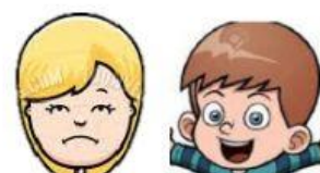
GIRL - SAD

TASK B. Fill in the gaps with the correct comparative form of the correct adjective according to the case: