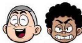
MAN – OLD