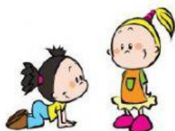
BABY – YOUNG