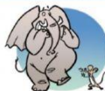
MOUSE - SMALL