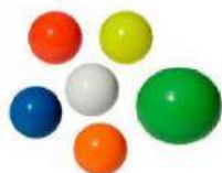
GREEN BALL - BIG

TASK A. Write a comparative sentence using the words written below the pictures. Follow the example: