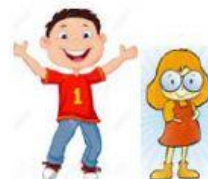
BOY - TALL