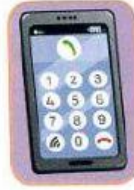
a cell phone