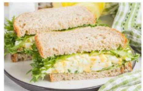
Egg sandwich ham and cheese