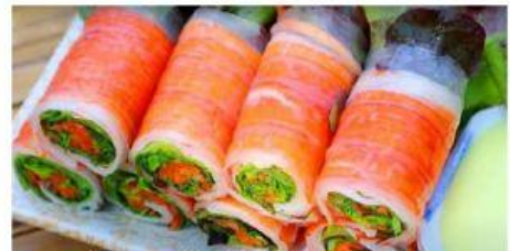
Bacon wrap / salad roll