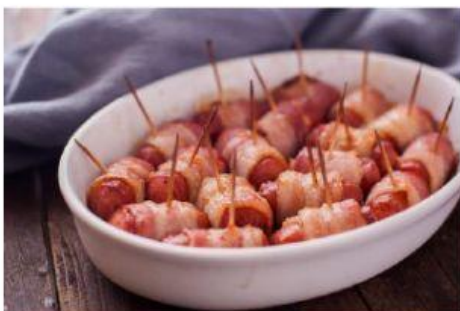
Sweet bacon wrap beef nachos