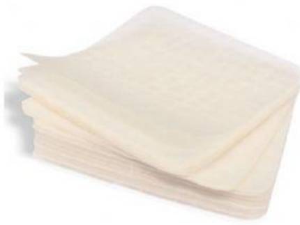
rice paper / baking paper

Type the correct name of each ingredient or recipe.