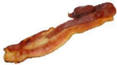
sausage / bacon