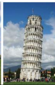
Pisa Tower (1173)

b) Stonehenge is one of _____ man-made structures on Earth. (old)