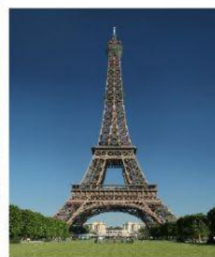
Eiffel Tower (324m)

d) Tokyo Skytree is _____ freestanding structure in the World. (tall)