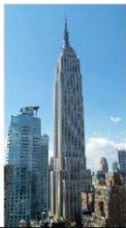
Empire State Building (1930)

a) Danyang-Kunshan Grand Bridge is _____ in the world. (long)