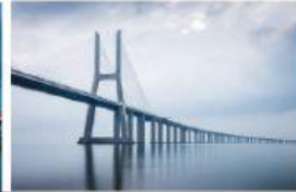
Danyang-Kunshan Grand Bridge

a) Danyang-Kunshan Grand Bridge is _____ in the world. (long)