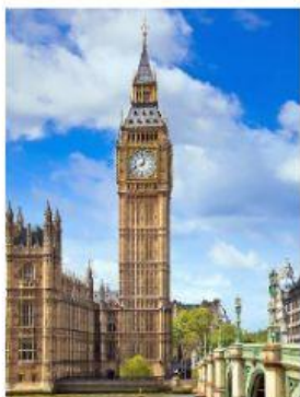
The Big Ben (96m)

c) Empire State Building is _____. (new)