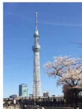
Tokyo Skytree (634m)