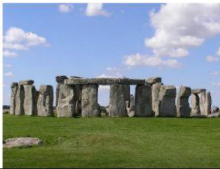
Stonehenge (about 2500 BC)